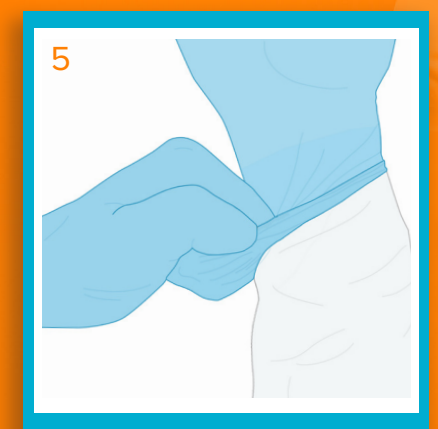
Pull the glove down, making sure you avoid puncturing the gloves with fingernails by pulling down gloves with your knuckles.