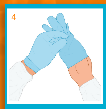
Lift the second glove up by hooking your index finger under the folded cuff of the glove. Place the glove over your fingers.