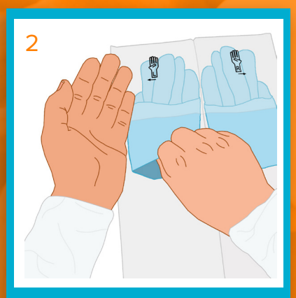
Sterile gloves are hand specific. Begin with the glove for your non-dominant hand by gripping the bottom of the folded cuff to remove from the packaging.