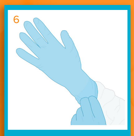
Secure the cuff firmly over your sleeve creating a secure barrier from bodily contaminants. Make sure gloved fingertips do not touch your skin.