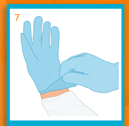
Now your dominant hand is gloved, pull the cuff of the first glove fully down over your sleeve to ensure minimal risk of contamination.