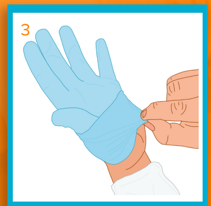
Gently roll down the cuff with your thumb and index finger. Avoid touching the inside of the cuff with your bare hand and, for now, leave it half rolled down.